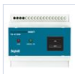
2730 INIBIT 973 COMANDO R.MODE