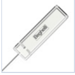
15037 MODULO LGFM