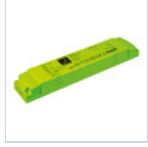
19371 INV P&L LED SE/SA 3H 60-180V