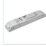
19399 INV UNIV CT/LG/DALI 5W 20- 250V