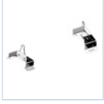
201954000 KIT 2 GANCI SOSPEN ST EASY LED