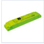
19367 INV P&L LED SE/SA 1H 60-180V