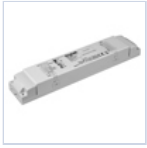
19398 INV UNIV AT RM 5W 20-250V