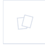
RA13 BOOSTER BAT LiFe 6.4V 1.5Ah