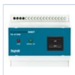
2730 INIBIT 973 COMANDO R.MODE