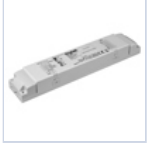
19398 INV UNIV AT RM 5W 20-250V