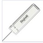
15037 MODULO LGFM