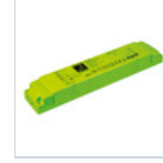
19367 INV P&L LED SE/SA 1H 60-180V