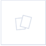
RA13 BOOSTER BAT LiFe 6.4V 1.5Ah