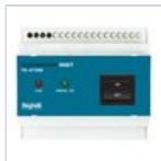
2730 INIBIT 973 COMANDO R.MODE