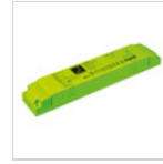
19367 INV P&L LED SE/SA 1H 60-180V