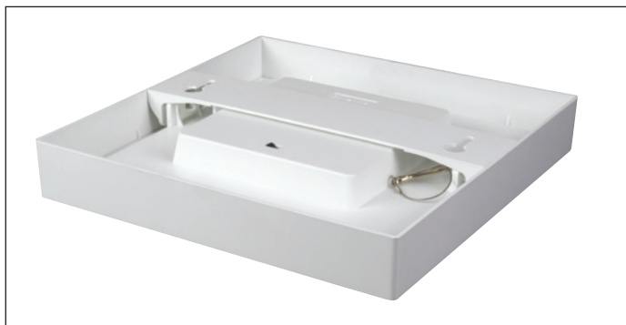
Quick mounting bracket for ceiling installation Switch to select the desired color temperature