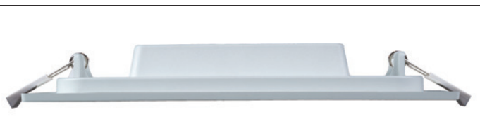
Recessed ceiling version