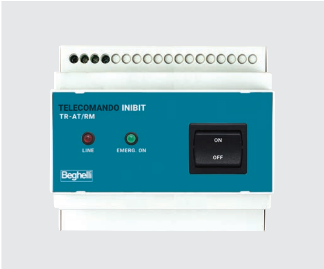
RM INIBIT REMOTE CONTROL