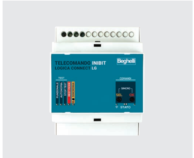
LG INIBIT REMOTE CONTROL